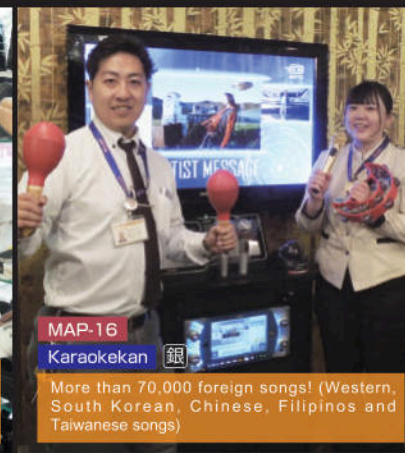
MAP-16 Karaokekan 銀 More than 70,000 foreign songs! (Western, South Korean, Chinese, Filipinos and Taiwanese songs)