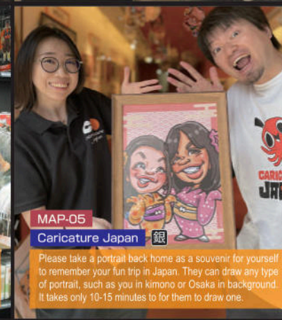
MAP-05 Caricature Japan 銀 Please take a portrait back home as a souvenir for yourself to remember your fun trip in Japan. They can draw any type of portrait, such as you in kimono or Osaka in background. It takes only 10-15 minutes to for them to draw one.