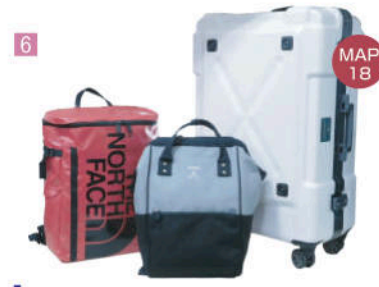
Jaguar Kaban TAX FREE 銀

Inspiration of this konpeito in a sweet small bottle came from Dotonhorikawa’s neon light!