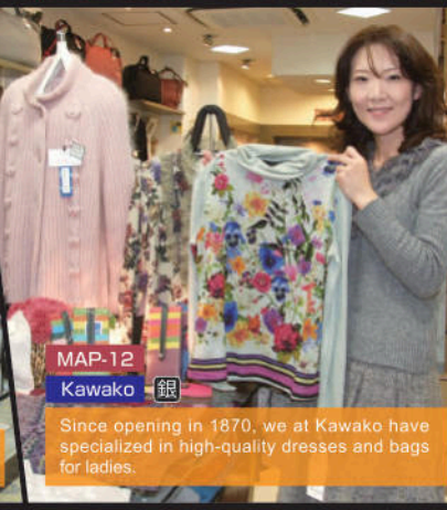
MAP-12 Kawako 銀 Since opening in 1870, we at Kawako have specialized in high-quality dresses and bags for ladies.