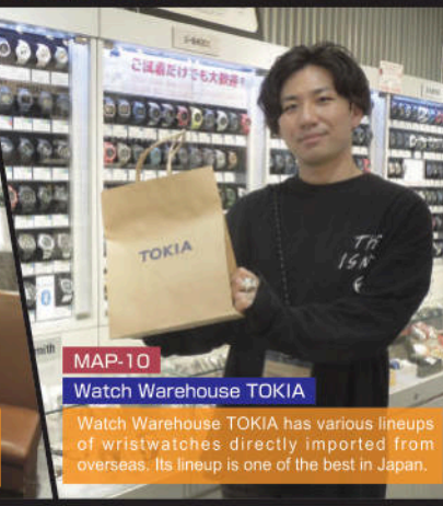
MAP-10 Watch Warehouse TOKIA Watch Warehouse TOKIA has various lineups of wristwatches directly imported from overseas. Its lineup is one of the best in Japan.