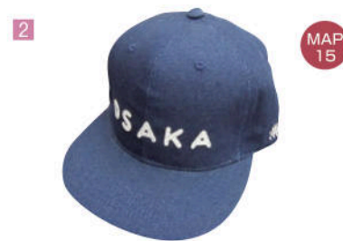
SHOP MU 銀

Black soybeans flavored with green tea milk. We use domestically produced black soybeans.