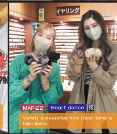
MAP-22 Heart dance 銀 Variety accessories from trend items to basic items.