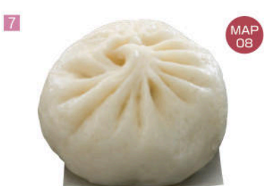
551 Horai 銀

From the traditional foods of well-established stores to the latest hot item, you can find it all to enjoy as you leisurely amble through the arcade.