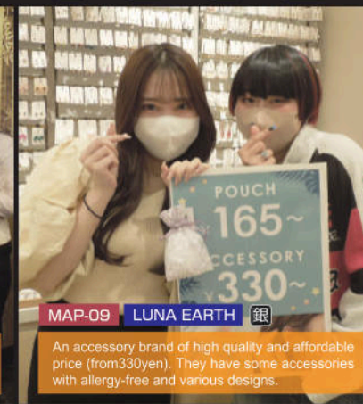
MAP-09 LUNA EARTH 銀 An accessory brand of high quality and affordable price (from 330yen). They have some accessories with allergy-free and various designs.