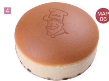
Rikuro Ojisan's Shop

Quality Japanese-made creased hats are not only trendy, but easy to wear.