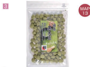
Oguraya TAX FREE 銀

Place your pictures from your trip, or of your loved one, into these Japanese photo frames, and make your special photos mean that much more.