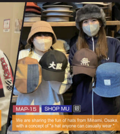
MAP-15 SHOP MU 銀 We are sharing the fun of hats from Minami, Osaka, with a concept of "a hat anyone can casually wear."