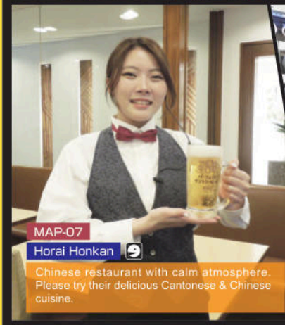
MAP-07 Horai Honkan Chinese restaurant with calm atmosphere. Please try their delicious Cantonese & Chinese cuisine.