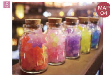
Ichibirian TAX FREE 銀

Our popular cheesecakes are freshly baked throughout the day in our shop’s kitchen.