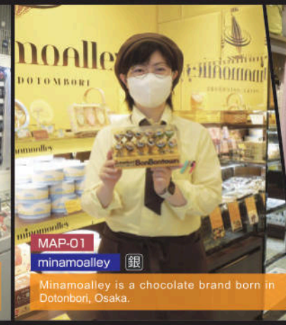
MAP-01 minamoalley 銀 Minamoalley is a chocolate brand born in Dotonbori, Osaka.