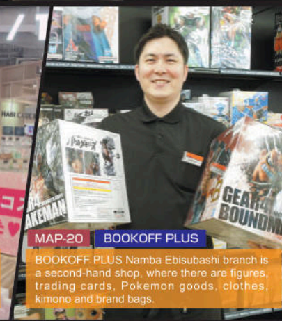
MAP-20 BOOKOFF PLUS BOOKOFF PLUS Namba Ebisubashi branch is a second-hand shop, where there are figures, trading cards, Pokemon goods, clothes, kimono and brand bags.