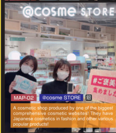
MAP-02 @cosme STORE 銀 A cosmetic shop produced by one of the biggest comprehensive cosmetic websites! They have Japanese cosmetics in fashion and other various popular products!

Sennichimae Doguya-suji Shopping Street is lined with specialty stores for all manners of cooking utensils and kitchenware. The stores are congregated in this area to accommodate the great number of Osakan chefs whose extensively honed minds and skills have earned Osaka the nickname, "The Kitchen of the World." Of course, these shops offer all kinds of different cooking utensils for household use, as well. Visitors of all ages can also enjoy trying their hand at making plastic food replicas, just like the ones on display in Japanese restaurant windows!